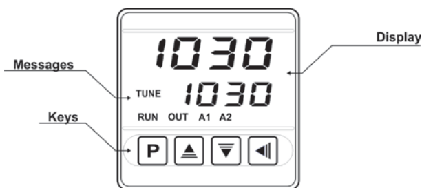
Fig. 02 - Identification of the parts referring to the front panel

The controller's front panel, with its parts, can be seen in the Fig. 02: