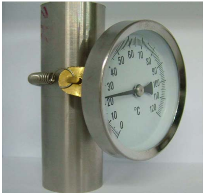
PIPE SURFACE THERMOMETER