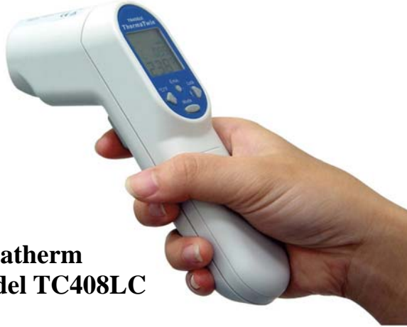
Infratherm Model TC408LC

Temperature Controls have a wide range of Immersion / Surface / Roller/ Magnetic and Stab probes available from stock .